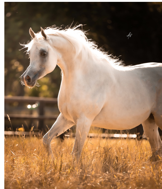
EKS Bint Helwah

This is a rare and exciting opportunity to buy an embryo for IBN FARID to EKS BINT HELWAH. This foal will be a full sibling to Junior Male World Champion EKS FARAJJ.